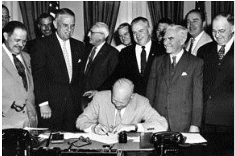
President Eisenhower signing HR7786, changing Armistice Day to Veterans Day.

Photo and information from the United States Department of Veterans Affairs website. http://www1.va.gov/opa/vetsday/vetdayhistory.asp